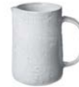
Jug pack of 1 16 x 10.5 x 17 cm 6.2 x 4.1 x 6.6 in ● Stone 10727