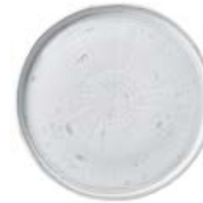
Plate 27.5 pack of 4 27.5 x 3 cm 10.8 x 1.1 in