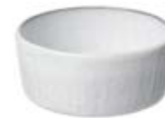
Bowl 15 pack of 4 15 x 6.5 cm 5.9 x 2.5 in