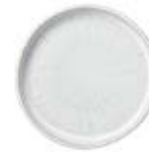
Plate 18.5 pack of 4 18.5 x 2.5 cm 7.2 x 0.9 in