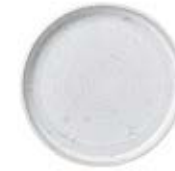
Plate 22.5 pack of 4 22.5 x 2.5 cm 8.8 x 0.9 in